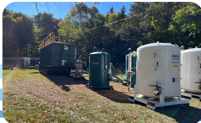
Frac tanks positioned beside Smith well in preparation for pump replacement project.

As part of scheduled inspections in 2025, Pease Tradeport's supply wells underwent routine cleaning and maintenance to help ensure the continued reliability, performance, and safety of the water system. This work included replacing a section of the Haven Well's column pipe, upgrading the Harrison Well's pump for improved performance, and installing a new submersible pump at Smith Well. Regular well maintenance is an important part of protecting our groundwater sources. These efforts help maintain consistent water pressure, improve system efficiency, and reduce the likelihood of unexpected equipment issues.