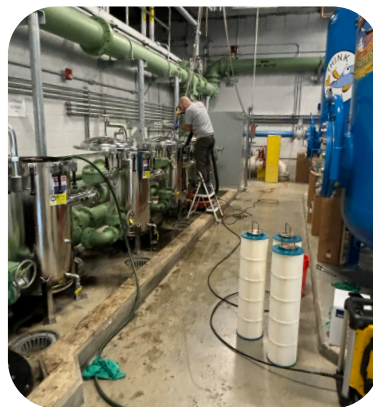
Pease Tradeport Water Treatment Operator replacing cartridge filters at the Grafton Road Treatment Facility.