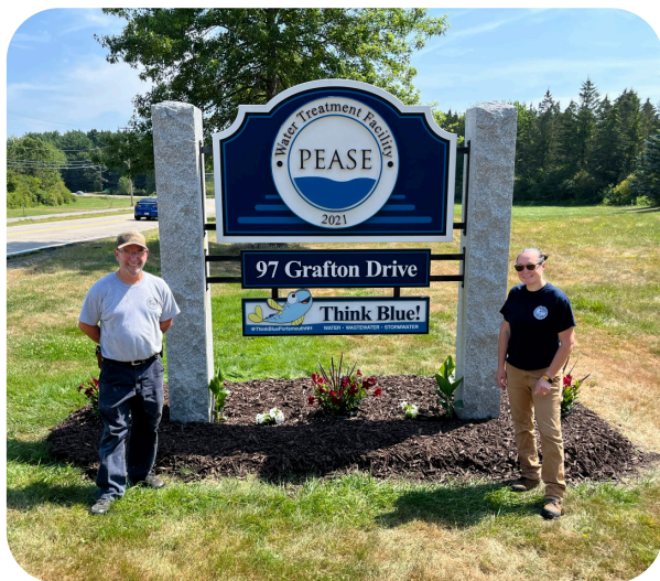
Portsmouth Water Treatment Operators following landscaping efforts around the Grafton Road Water Treatment Facility.

When additional supply is needed from the Portsmouth Water System, the water that is pumped from Portsmouth primarily consists of water from three groundwater wells: Portsmouth Well #1, Collins Well, and Greenland Well. Sodium hypochlorite and poly/ortho-phosphate are added to the water supplied by these wells. Fluoride as hydrofluorosilicic acid is also added at the Greenland Well. Occasionally, water from the City's sources in Madbury may contribute to the water pumped into Pease from the Portsmouth Water System. The Madbury sources include the Bellamy Reservoir and four groundwater wells located beside the Madbury Water Treatment Facility. For more information on the treatment processes that occur at this facility, see the Portsmouth Water System's Annual Drinking Water Quality Report located on the City's website: https://portsnh.co/Drinking-Water-Reports .