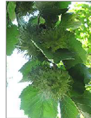
Turkish Hazelnut leaf