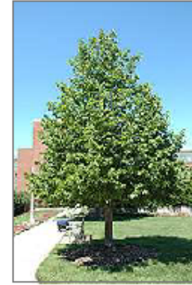
Turkish Hazelnut

Turkish Hazelnut will grow to be about 45 feet tall at maturity, with a spread of 20 feet. It has a low canopy with a typical clearance of 4 feet from the ground, and should not be planted underneath power lines. It grows at a medium rate, and under ideal conditions can be expected to live for 70 years or more.