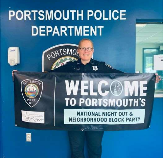
CITYWIDE NEIGHBORHOOD COMMITTEE NATIONAL NIGHT OUT AUG 2, 5-8 pm --

PROJECT -- Impacting Sagamore Avenue, Shaw Road, Cliff Road and Walker Bungalow Road. During construction travel on the streets will be limited, intermittently, to a single lane of alternating one-way travel Mon-Fri between 7 am and 6 pm. Go to the <u>Sagamore Ave. Project page</u> for more information.