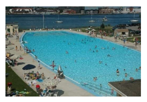
PEIRCE ISLAND OUTDOOR POOL NOW OPEN – Go to daily schedule. <u>https://tinyurl.com/4dykjz2d</u>

FREE GUIDED TOURS OF PRESCOTT PARK GARDENS EVERY FRIDAY STARTING JUL 8: 11 am – 12 pm and 1-2 pm. Meet at the Liberty Pole entrance on Marcy Street. Led by the City interns who design and planted the gardens.