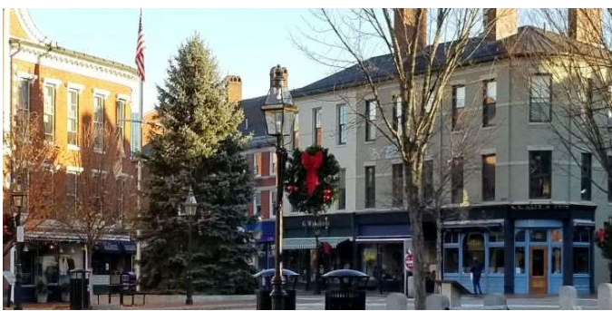
HOLIDAY TREE LIGHTING & ILLUMINATED HOLIDAY PARADE SAT DEC 4 (rain/snow date Sun Dec 5). For all the details, <u>click here</u>.

https://www.cityofportsmouth.com/city/2021-holiday-lights-contest Register by Dec 10. Judging takes place between Dec 11 and 19, with winners announced at the City Council meeting Dec 20. Seacoast Media Group is the media sponsor.