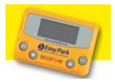
CITY PHASING OUT EASYPARK PROGRAM – ENDS DEC 31, 2021 – EasyParkUSA has already discontinued the sale of new devices, although

NUTCRACKER NOV 26 – To register, click here: <u>https://tinyurl.com/wd7h6mzh</u> $138 per person. Depart Senior Activity Center at 10:30 am and stop for lunch at Prince Pizza + Pasta. Travel in a coach bus complete with wifi and bathrooms. Attend 1:30 pm show. Return to Portsmouth, 6 pm. Reservations required: call 603-610-4433. Payment is expected at time of registration; cash, check, credit card. Price includes orchestra level ticket, transportation, lunch, tax + tip for both restaurant and bus driver. This trip is recommended for ages 12+ and the Boston Opera House requires all attendees to show proof of vaccination or a recent negative COVID-19 test. The bus company requires, per Federal law, that masks be warn at all times on the bus.