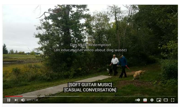
Stormwater Outreach Video - Dog Walk Redemption

For FAQs and additional information click here.