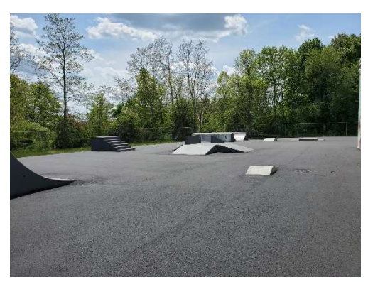
NATIONAL SKATEBOARD DAY CELEBRATION JUN 21 from 5-7 pm at Greenleaf Skateboard Park -- The Portsmouth Skateboard Park Mayor's Blue Ribbon Committee invites the public "for pizza, skateboard tricks, prizes and fun."

PEVERLY HILL COMPLETE STREETS PROJECT NEIGHBORHOOD INPUT MEETING MON JUN 28 at 6:30 pm -- This is a hybrid meeting. Members of the public are able to attend the meeting in person in City Hall Chambers OR participate remotely, via Zoom. For the Zoom registration, click here: <a href="https://tinyurl.com/n4dnnnzz">https://tinyurl.com/n4dnnnzz</a> The purpose of the meeting is a follow-up to the public site walk held on April 3, 2021. The meeting gives the public an additional opportunity to see and discuss the project limits and easements that will be necessary along the roadway corridor. City staff will be present to provide information and answer questions.