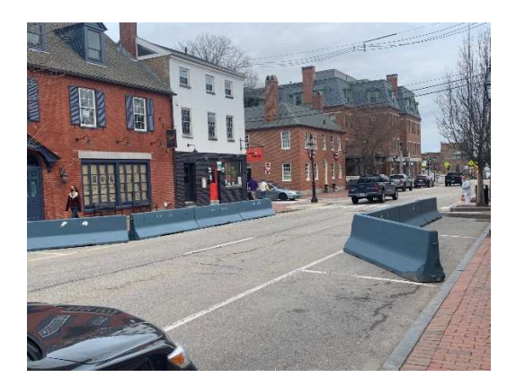
OUTDOOR DINING – MORE BARRIERS BEING PLACED THIS WEEK! Be sure to check with your favorite restaurant about their plans.

Operators Grant (SVOG) applications will be accepted starting Thursday, April 8, 2021. As the SBA builds and prepares to open the program, the dedicated <u>SBA</u> website, which includes <u>frequently asked</u> <u>questions</u>, <u>video tutorials</u> and other SVOG detail. Potential applicants should register in the federal government's System for Award Management (SAM.gov), as this is required for an entity to receive an SVOG, and reference the <u>preliminary application</u> <u>checklist</u> and <u>eligibility requirements</u>.